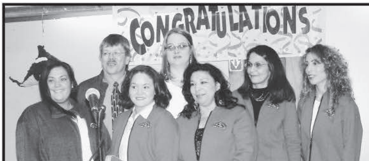
The TANF staff gathers together to celebrate the facility's Grand Opening

Located across from the main Tribal offices, the new TANF facility will provide services to Native families to aid in their transition from welfare to work and self-