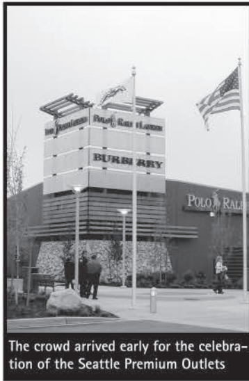
The crowd arrived early for the celebration of the Seattle Premium Outlets

a popular destination that draws thousands of shoppers each day, the Seattle Premium Outlets expect to draw nearly six million annual visitors, playing a significant role in the economic prosperity of the surrounding area.