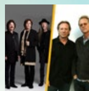
Doobie Brothers and America!

Sunday, August 18th, Tickets start at $25