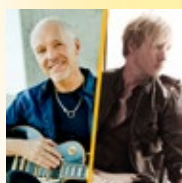
Peter Frampton and Kenny Wayne Shepherd! Special guests David Hidalgo from Los Lobos and Mike McCready from Pearl Jam

Sunday, August 25th, Tickets start at $30