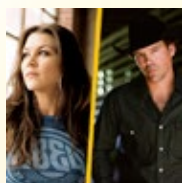
Gretchen Wilson and Clay Walker!

Tickets available at Rewards club or Tickets available at Ticketmaster.com